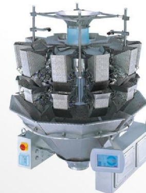
(Dimple Finish Hopper)