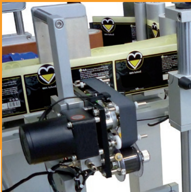
Hot foil coding unit

LABELX JR 140 EW Start photocell Conveying module with flat belt Wrap around device COMPACT main frame Horizontal and vertical microregulation unit