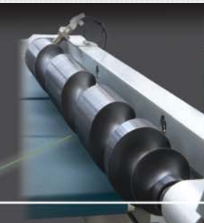
Screw feeding group